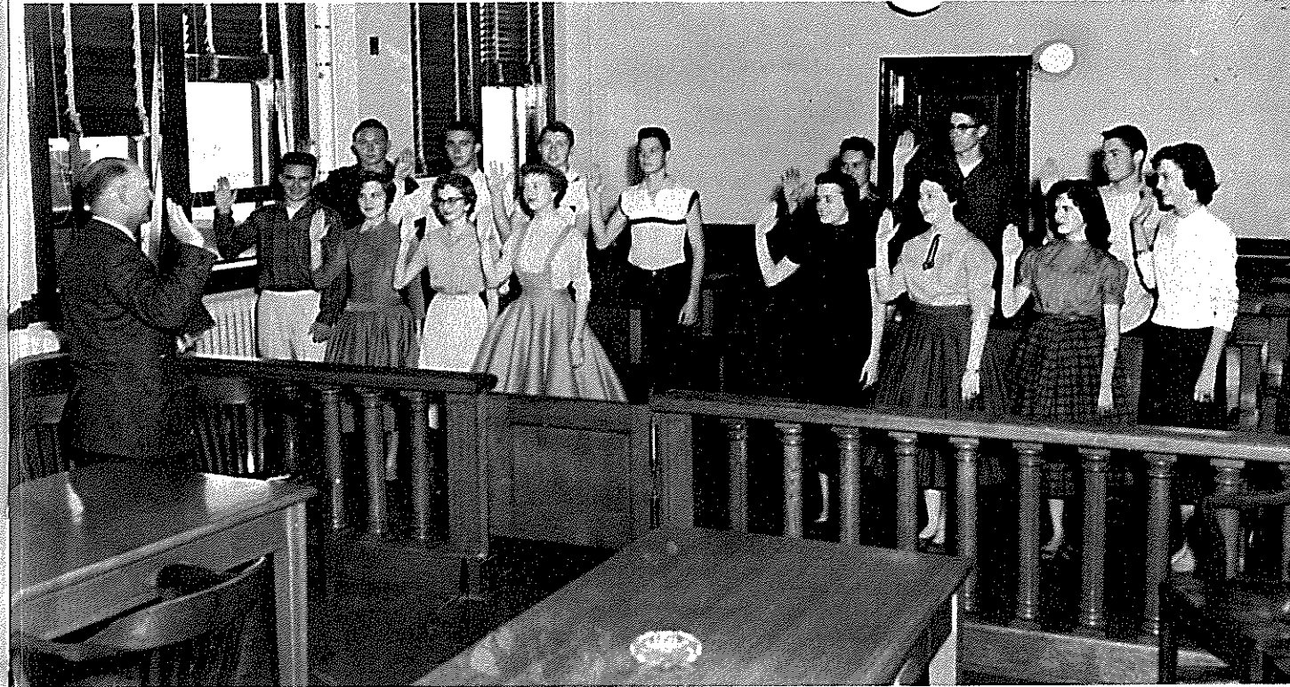
Sixteen students participated in County Government Day. This annual event is sponsored by the American Legion Auxiliary. The student officials were honored at a banquet that night, with officials as guests of honor.